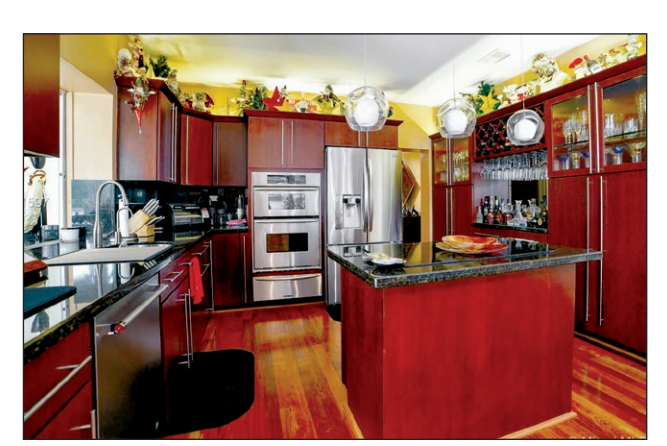
The kitchen features wood cabinetry and stainless steel appliances.

Ave, in Miami, is offered at $1,690,000.