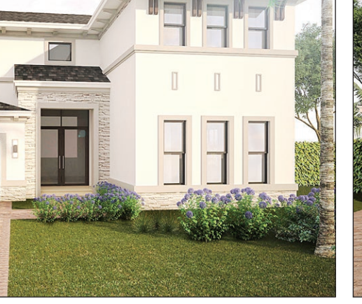
Most models in the three new communities feature hurricane impact resistant windows and doors, two-car garage and covered terraces.

different models and also ranges from four- to five-bedroom homes with three and a half to five bathrooms. Both communities are open for sale as of this weekend.