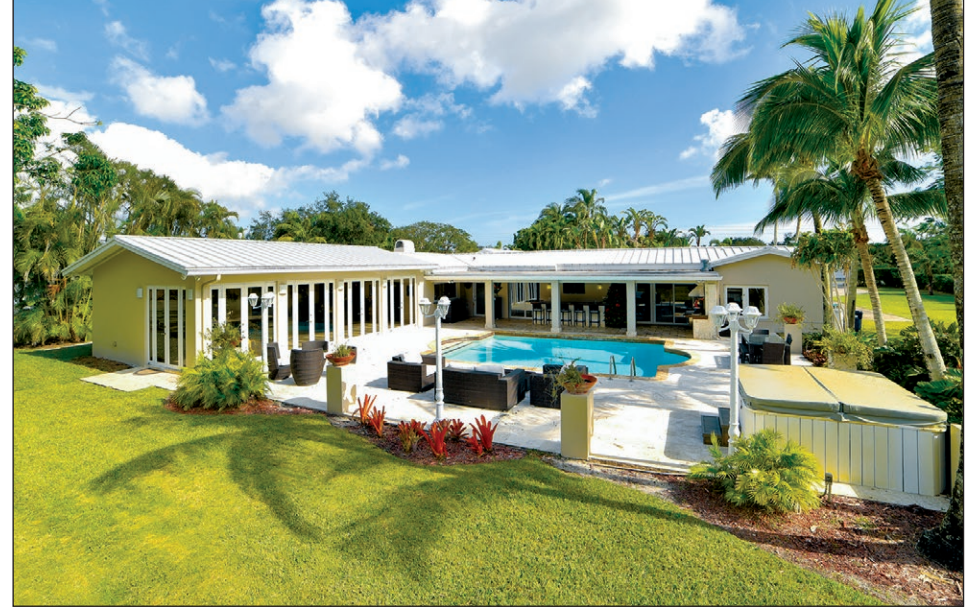
The backyard paradise features a huge covered patio with large pool, spa and outdoor kitchen.