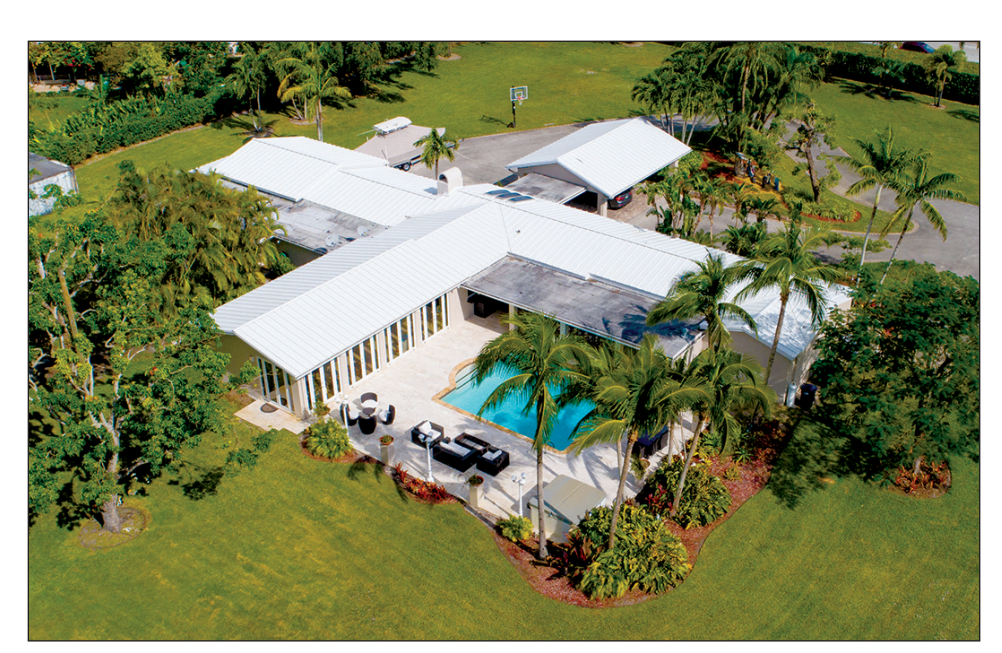
The 1.71-acre gated residence is in The Falls area of Miami.

SPECIAL REAL ESTATE SECTION • SATURDAY, FEBRUARY 24, 2018